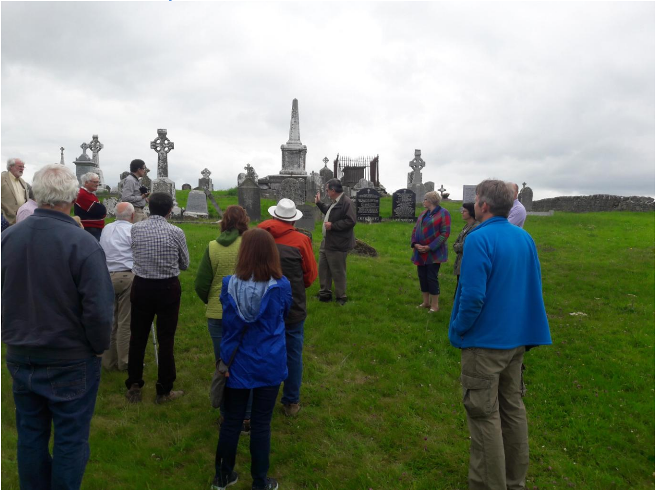
Kilkeary graveyard "flooded with Kennedy D.N.A."