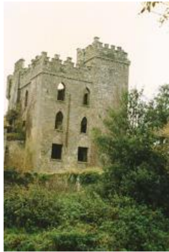
Cloghenane castle, Templederry.